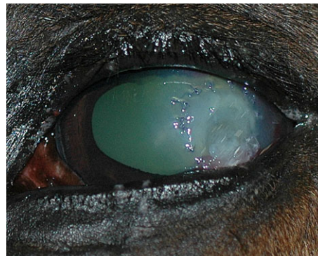
Figure 5. Case shown in Fig. 4, positive fluorescein uptake only around graft sutures, 18 days postoperatively at tarsorrhaphy removal. The area encircled by sutures was clear enough to see through cornea into the anterior chamber. Vascularization extended from the inferotemporal limbus axially.

In this retrospective study of surgical repair of severe keratomalacia with ACell ® grafts, 94% of affected corneas had successful outcomes. Because only horses with corneal lesions repaired using ACell ® graft were considered in this study, a direct comparison between surgical repair with ACell ® vs. conjunctival or amnion grafts is not possible, but length of medical therapy and visual outcome in this study did not appear subjectively to differ from patients with severe keratomalacia repaired using conventional