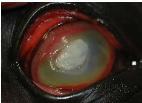
Figure 1. Pre-operative catastrophic cornea in 13-year-old Standardbred stallion, from mixed bacterial–fungal infectious keratitis ( Streptococcus and Aspergillus ) refractory to medical treatment. The horizontally oval axial fungal plaque is surrounded by a deep stromal furrow that threatened globe integrity. Corneal vascularization has advanced almost to the furrow superiorly. The cornea is characterized by a diffuse stromal infiltrate and severe edema precluding view of structures posterior to the cornea but for a faint outline of a miotic pupil and hypopyon inferiorly and nasally.

Surgery was performed on four patients the day of admission and initial examination based on severity of keratomalacia and perceived depth of the corneal lesion, and was performed the day following admission in 12 patients to allow overnight stabilization of the patient and the cor-