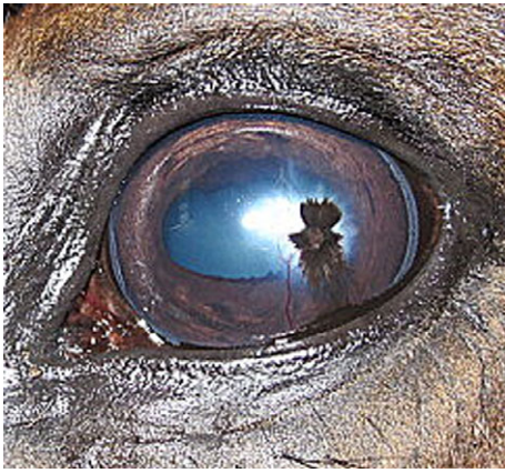
Figure 7. Case shown in Fig. 4, pigmented scar at 10 weeks. The horizontal oval axial region of the cornea corresponding to the original ulcer had become fairly clear, with only a focal region of fibrosis. Pigmentation from the inferotemporal limbus toward the lesion developed in a vertical band but should not compromise vision.

clarity and cosmesis, the main advantage of ACell ® graft as a biomaterial over amnion would be commercial availability and room temperature shelf storage.