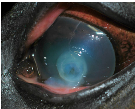
Figure 4. Pre-operative catastrophic cornea in 15-year-old Warmblood gelding, from mixed bacterial–fungal infectious keratitis ( Pseudomonas and Aspergillus ) refractory to medical treatment. There was a round axial melting ulcer with a dark center representing severe stromal melting and loss. There was no vascularization in this cornea which was treated aggressively prior to referral with a topical nonsteroidal anti-inflammatory drug. Malacic cornea was noted streaming from the center of the ulcer over the unaffected cornea inferior to it toward the eyelid margin, and when the eyelids were closed, this stream of malacic cornea protruded between the eyelids.

therapy, may have contributed to failure and enucleation in this case.