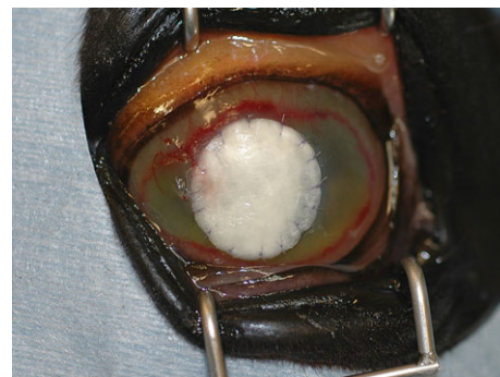
Figure 2. Case shown in Fig. 1, intra-operative ACell ® graft.

The patient that had the operated eye enucleated was a 7-year-old Friesian gelding who had been presented with advanced, preexisting chronic renal disease severely complicating medical management by limiting the use of flunixin meglumine. Two days postoperatively, this patient was discharged from the hospital against medical advice due to the severity of ocular as well as systemic disease. Financial constraints not evident at the time of surgery were responsible for discharge from hospital. Eleven days postoperatively, the horse was readmitted with a complaint of an iris prolapse in the operated eye, which was enucleated rather than repaired, again due to financial limitations. Corneal disease severity, as well as systemic disease which limited pre- and postoperative anti-inflammatory