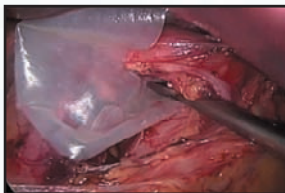
MatriStem HHM is positioned over hiatal opening repair site.